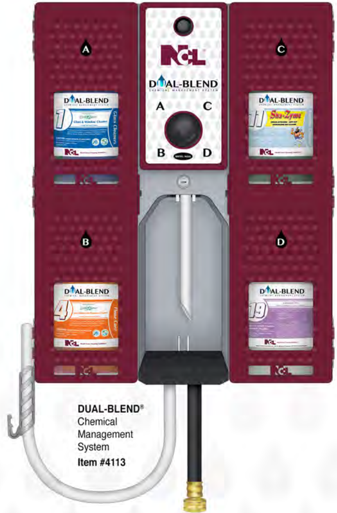
DUAL-BLEND® Chemical Management System Item #4113