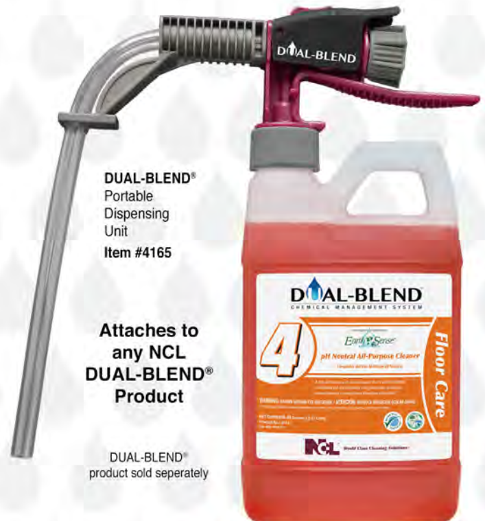
DUAL-BLEND® Portable Dispensing Unit Item #4165